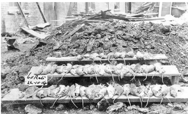
Bubonic plague first appeared in New Zealand in 1900. There were only a small number of deaths and the disease disappeared around 1911. Rats were known to be a carrier of the disease and efforts to kill them increased in the wake of plague fears. These rats were killed during a clean-up in Dunedin.